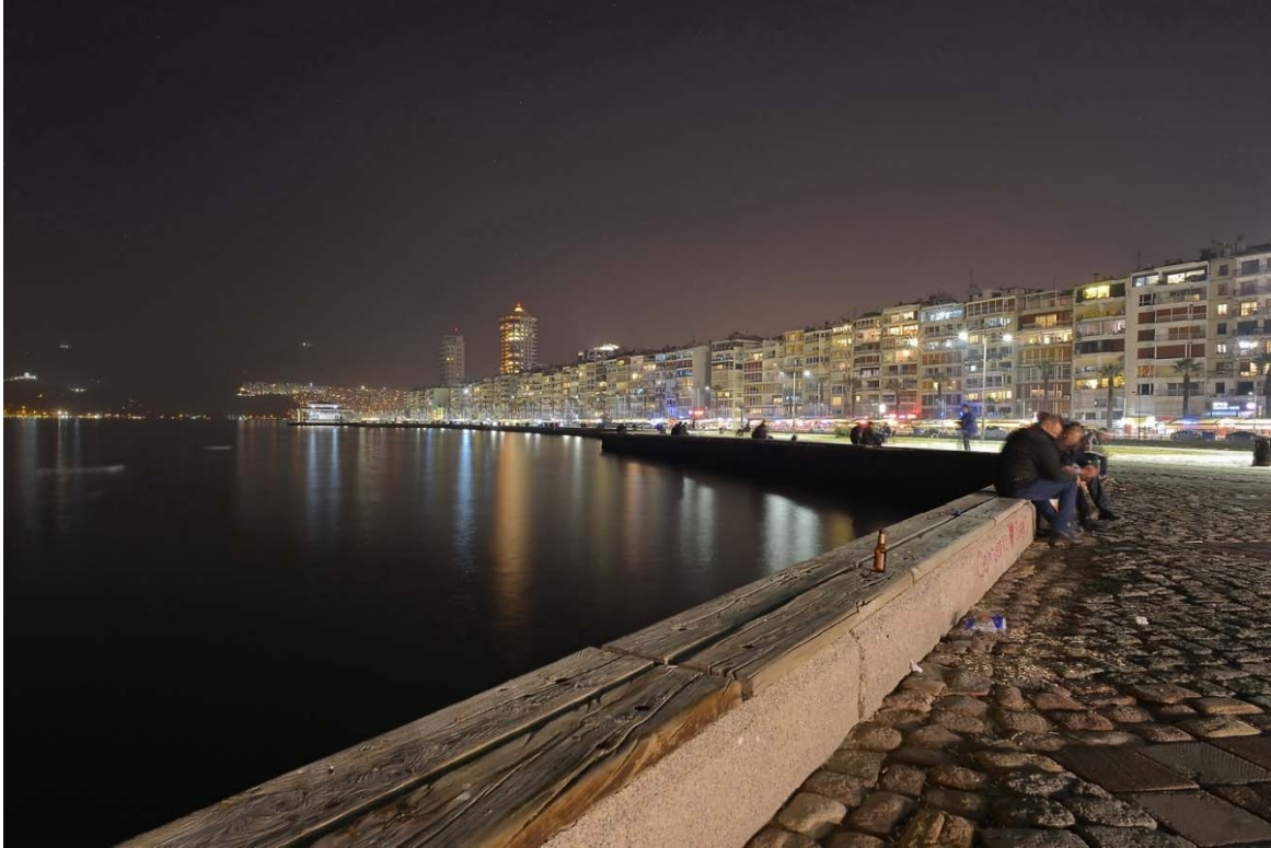
Fig. 1: Promenade of Izmir. DESEM and our Rectorate Building is not far from there...