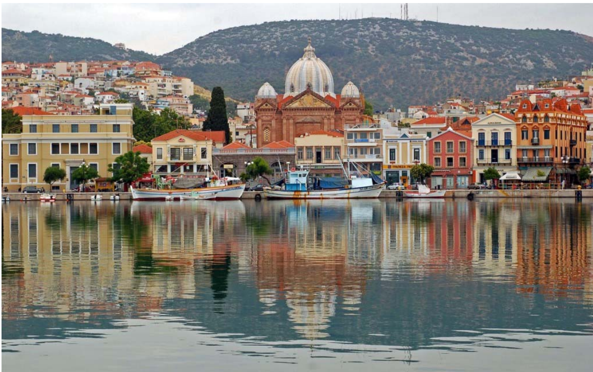
Fig. 2: Mytilini on Lesbos.