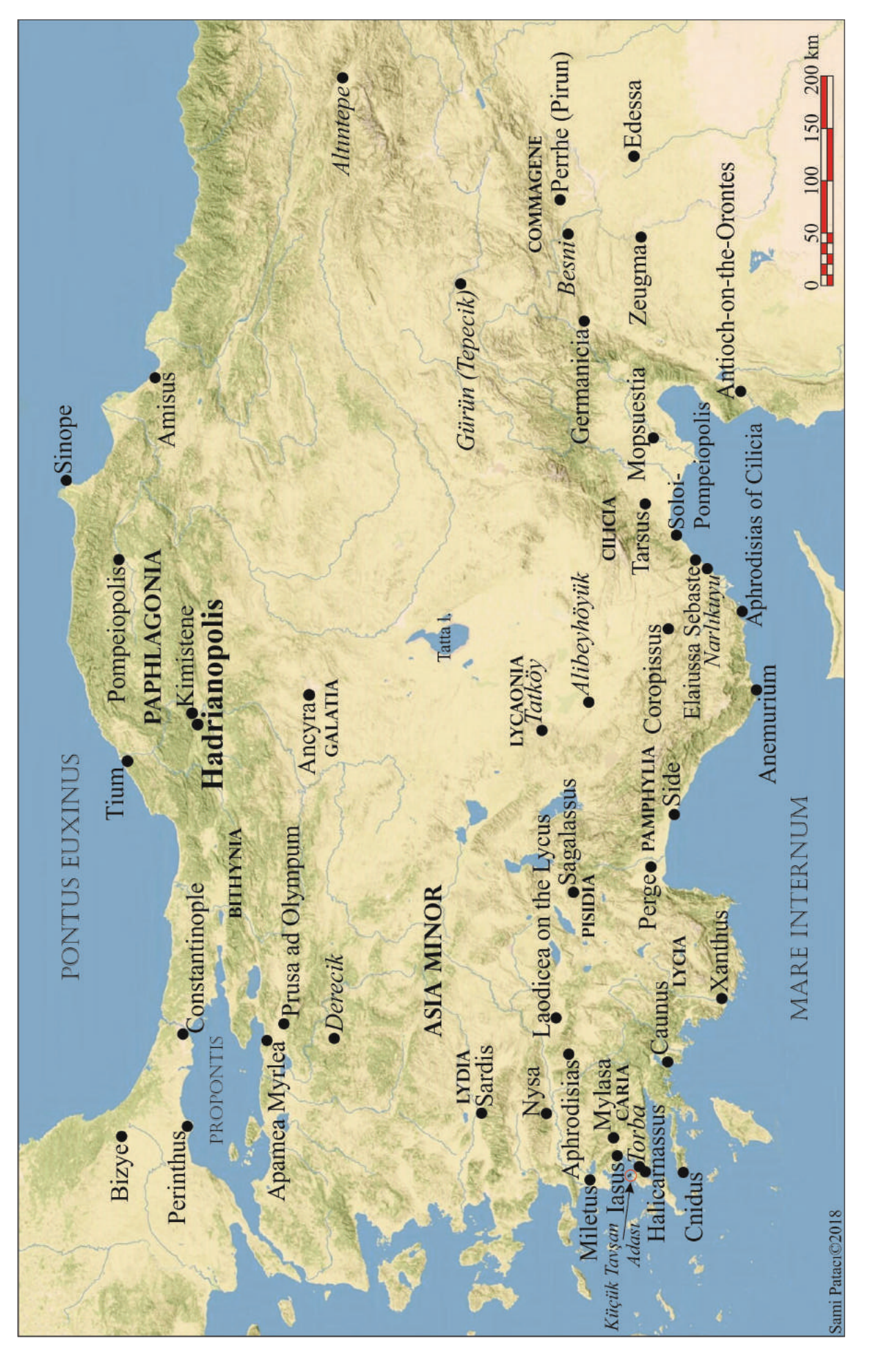
Fig. 1. Map of Turkey with some find places of mosaics and frescoes referred to in the text.